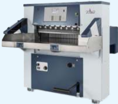
Cutting Machine POLAR D 80