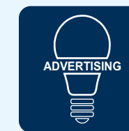
Advertising & Media