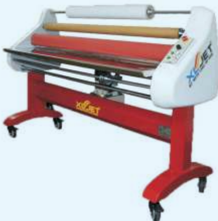
Hydraulic Cold Lamination Machine