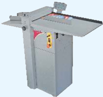
Morgana DigiCreaser and Perforation Machine